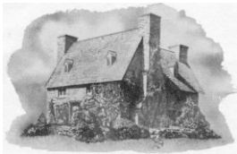
THE OLD STONE HOUSE