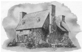
THE OLD STONE HOUSE