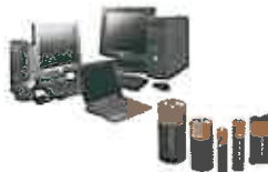
batteries or electronics