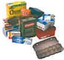
boxboard & paper egg cartons