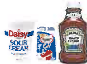
plastic food & beverage containers #3-#7 under 3 gallons