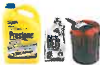
motor oil, anti-freeze, paint, or any hazardous material containers