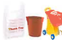
plastic bags, flower pots, plastic toys