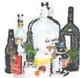
glass food & beverage containers