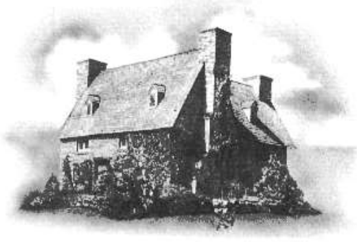
THE OLD STONE HOUSE