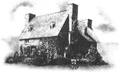
THE OLD STONE HOUSE