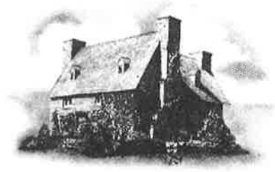
THE OLD STONE HOUSE