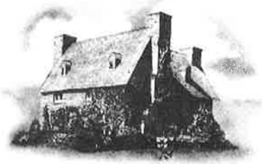
THE OLD STONE HOUSE