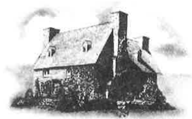
THE OLD STONE HOUSE