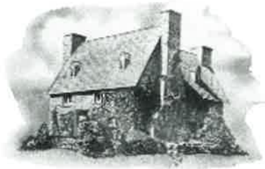
THE OLD STONE HOUSE