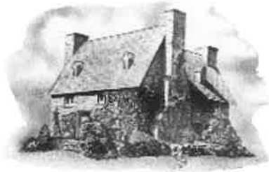
THE OLD STONE HOUSE