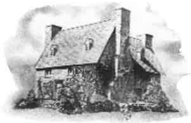
THE OLD STONE HOUSE