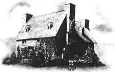
THE OLD STONE HOUSE