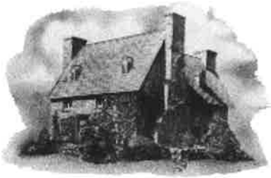
THE OLD STONE HOUSE