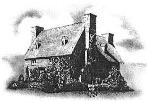
THE OLD STONE HOUSE