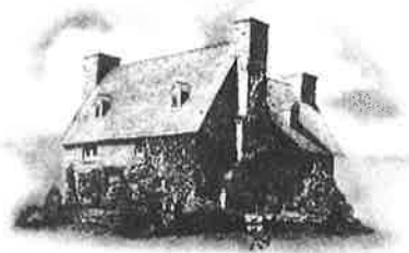
THE OLD STONE HOUSE