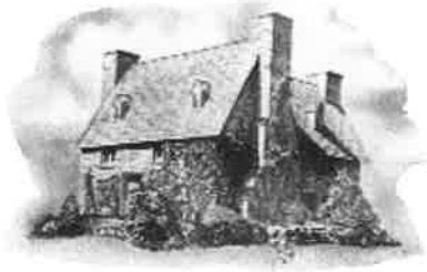
THE OLD STONE HOUSE