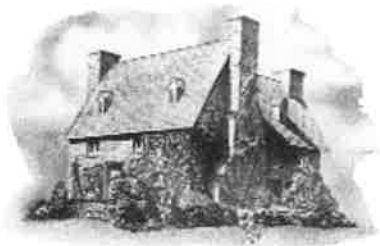
THE OLD STONE HOUSE