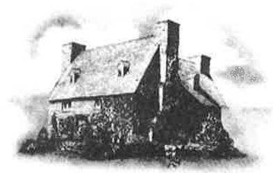
THE OLD STONE HOUSE