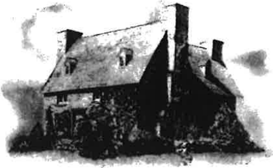
THE OLD STONE HOUSE