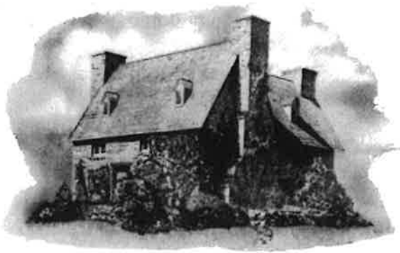
THE OLD STONE HOUSE