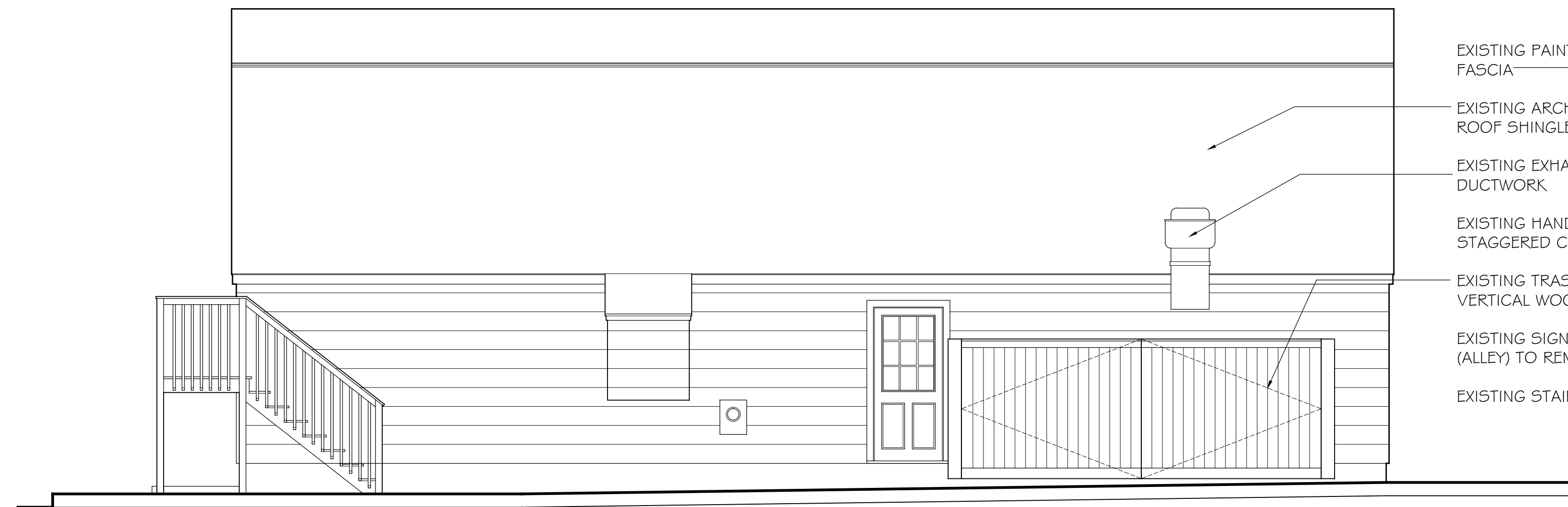
2 SOUTH ELEVATION - EXISTING A1 SCALE 1/4" = 1'-0"