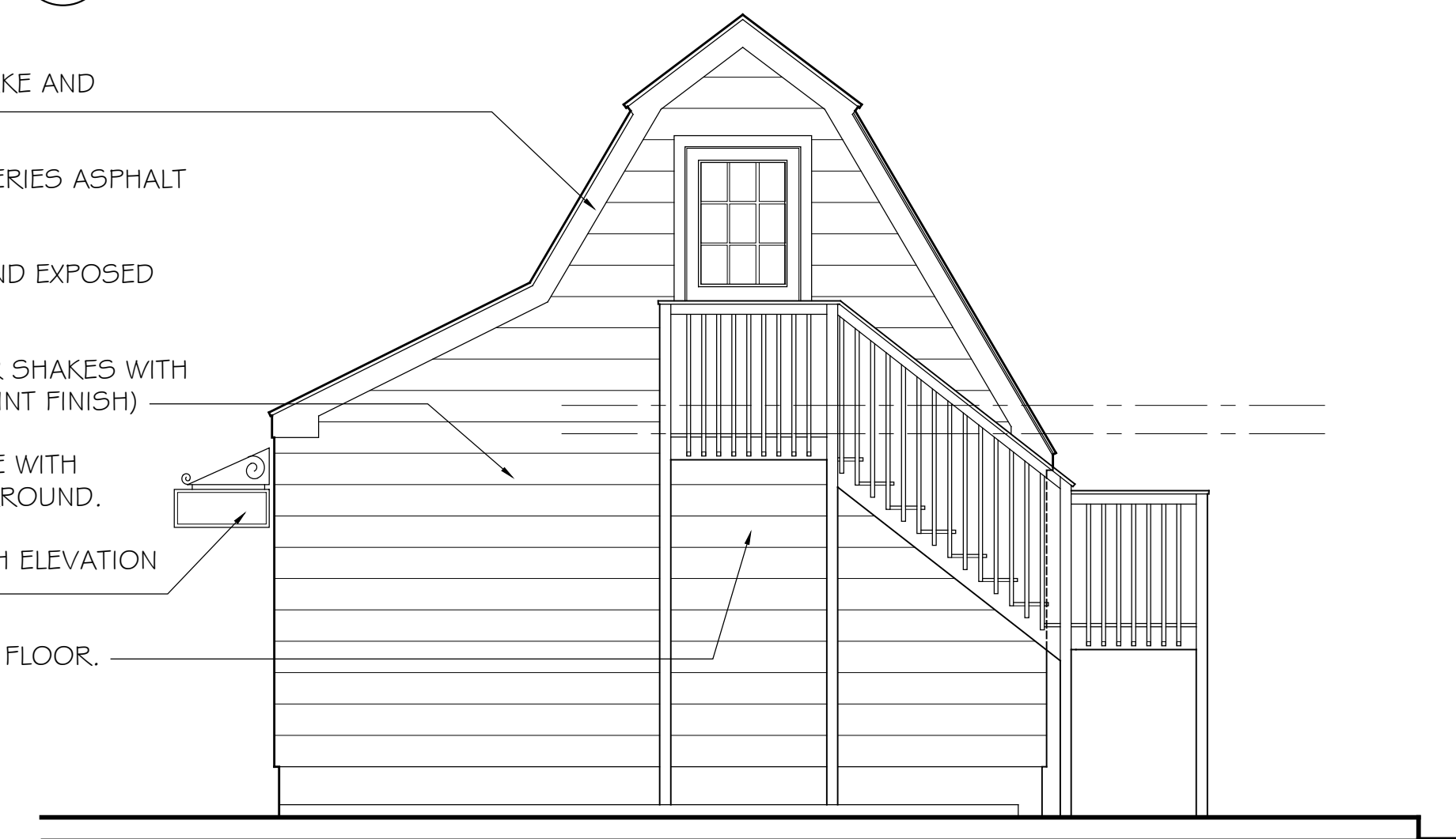
5 WEST ELEVATION - EXISTING A1 SCALE 1/4" = 1'-0"