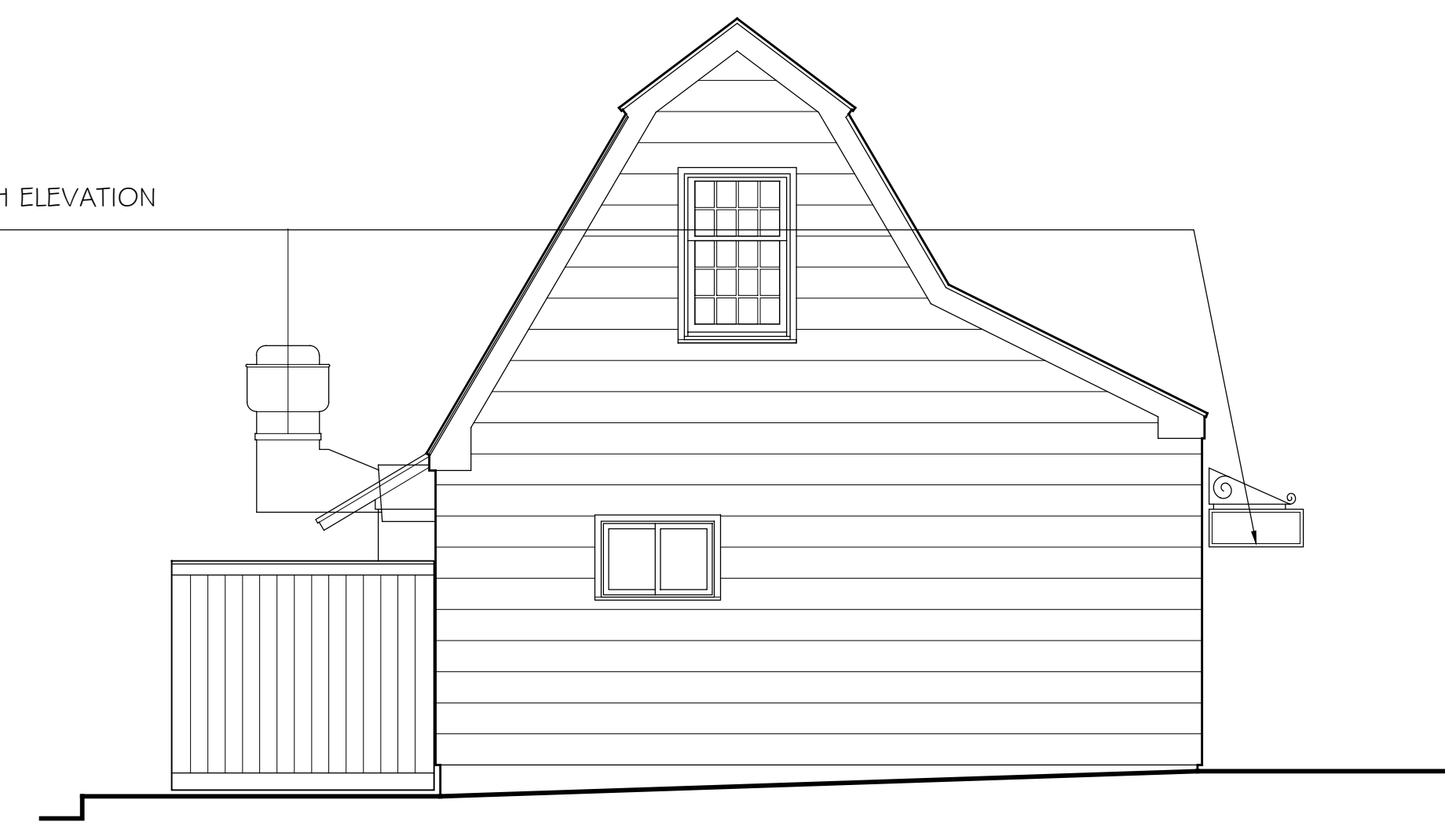
4 EAST ELEVATION - EXISTING A1 SCALE 1/4" = 1'-0"