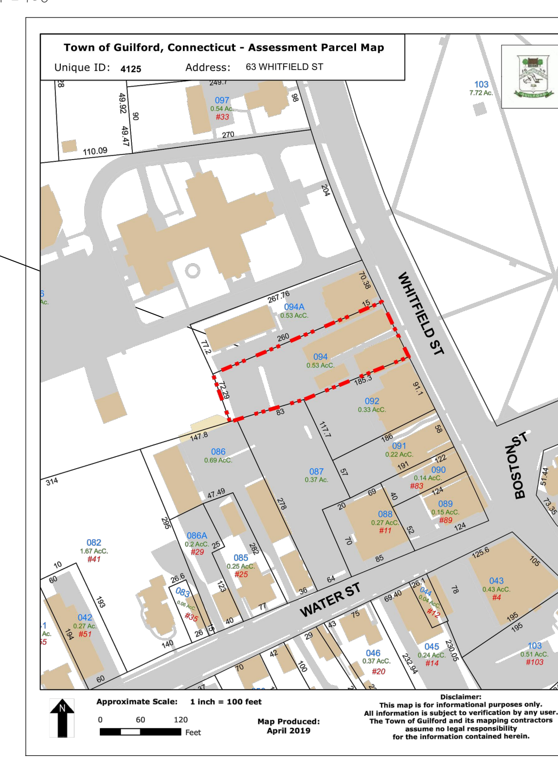
6 KEY PLAN A1 SCALE NONE